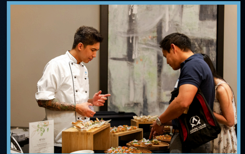
Images from State of the Chamber (February 27, 2024).